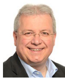
Markus Ferber Vice-Chair – EPP