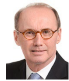
Othmar Karas Vice-Chair EPP