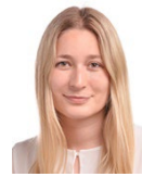
Kira Marie Peter- Hansen Vice-Chair – Greens/EFA