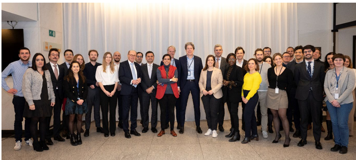
Subcommittee on tax matters: Members, political advisors, Members' assistants and staff of the FISC secretariat

Since 2022, the FISC Subcommittee has worked on the following work streams: 'Further reform of corporate taxation rules', 'Lessons learnt from the Pandora Papers and other revelations' and 'The role of taxation in times of crisis'.