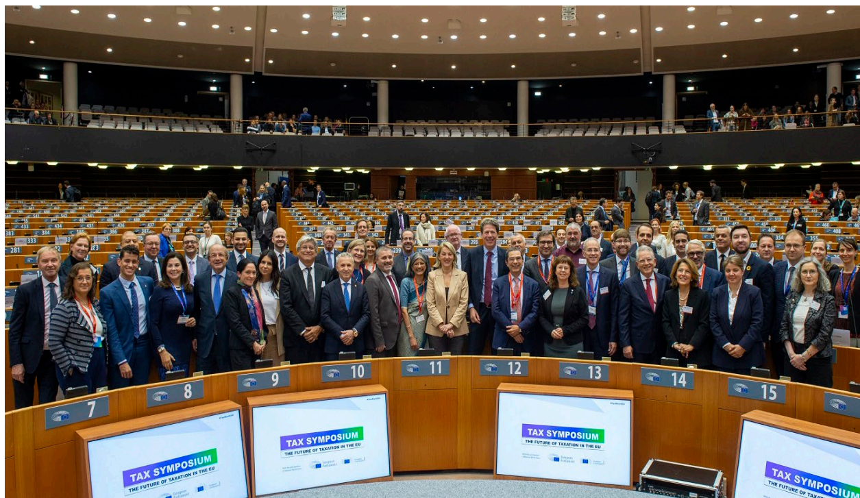
Tax Symposium 2023: speakers and Members of the European and National Parliaments in the hemicycle

On the first day, the Commission hosted a series of workshops on ' VAT in the digital world ', ' The role of behavioural taxation ', ' Balancing incentives and redistribution: The future of Personal income taxation ' and ' The role of wealth taxation in the tax mix of tomorrow '.